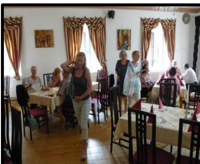
Summer Party 2015