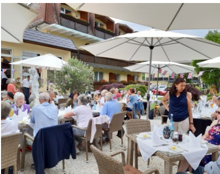
Summer Party 2023