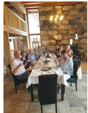
After the tour